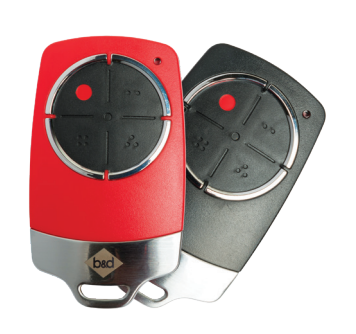
B&D Remote Control

B&D Rolling Door products have been tested in accordance to the wind requirements of AS/NZS 505:2012 (Garage Doors & Other large Access Doors) which complies to AS/NZS 1170.2:2011 (Wind actions) and AS 4055:2012 (Wind loads for housing).