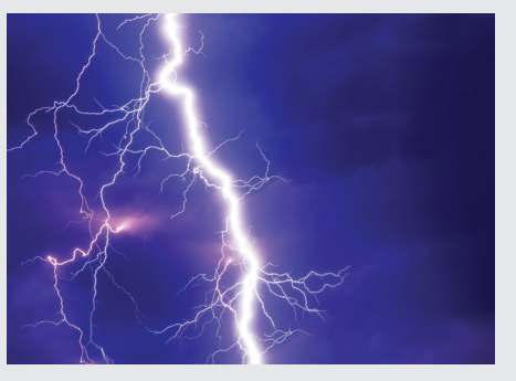
BATTERY BACK UP

Check if your door is closed and secure, no matter where you are.