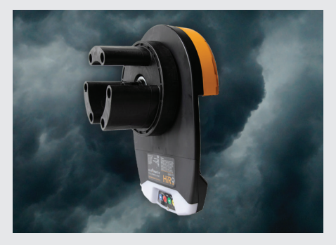
UPGRADE TO HIRO™

Ensure you have the ability to secure your garage, even in a black out.