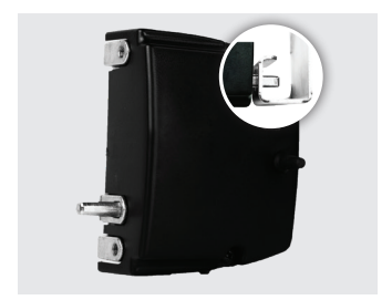
Auto-Lock protection, delivers a new level of security