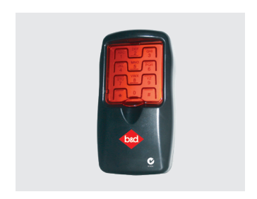
Keyless entry via secure code