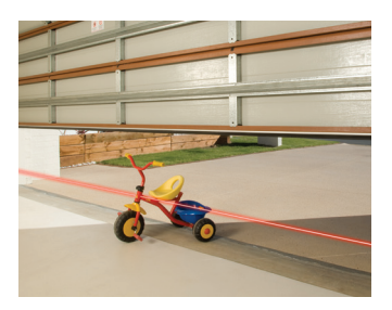
Non Contact Safety Beams further protect your family and pets